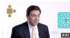
“Come to Turkey, Discover your own story!” - FORD MOTOR...

For videos of all CEOs participating in the campaign, please click here .