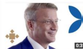
“Come to Turkey, Discover your own story!” - SBERBANK /...