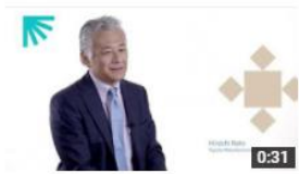
“Come to Turkey, Discover your own story!” - TOYOTA Turkey /...