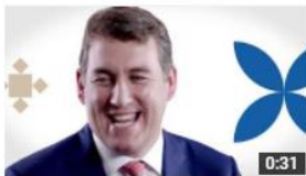
“Come to Turkey, Discover your own story!” - VODAFONE Turkey...

Global, BNP Paribas, Sberbank, General Electric (GE) Global, Toyota, Hyundai and Ford, have taken part and conveyed the unified message: "Come to Turkey. Discover your own story" in promotional films shot as part of the campaign. Speaking at the event, Economy Minister Nihat Zeybekci said Turkey has the most “ambitious” incentive program for investors. “We will invite prominent players of the business world and media to Turkey,” he added.